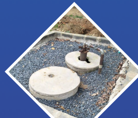
Rain water harvesting pits