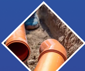
Water Supply Line