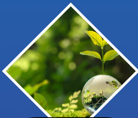
Pollution Free Environment